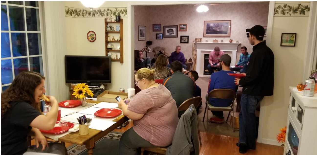
Meeting at the Boreen Residence