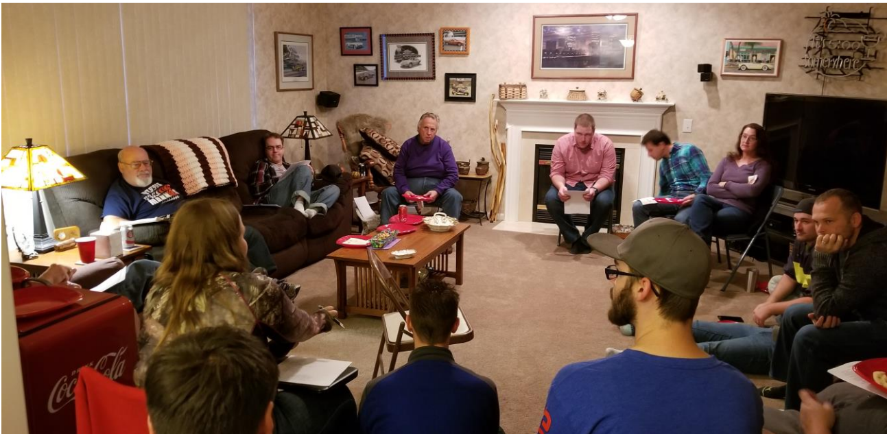
Meeting at the Boreen Residence

We are scheduled to be at the Donato's in Brownsburg for the December and February board meetings. The January board meeting will take place at the annual banquet. We will continue to look for another meeting spot.